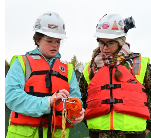
Eagle Mine lundin mining