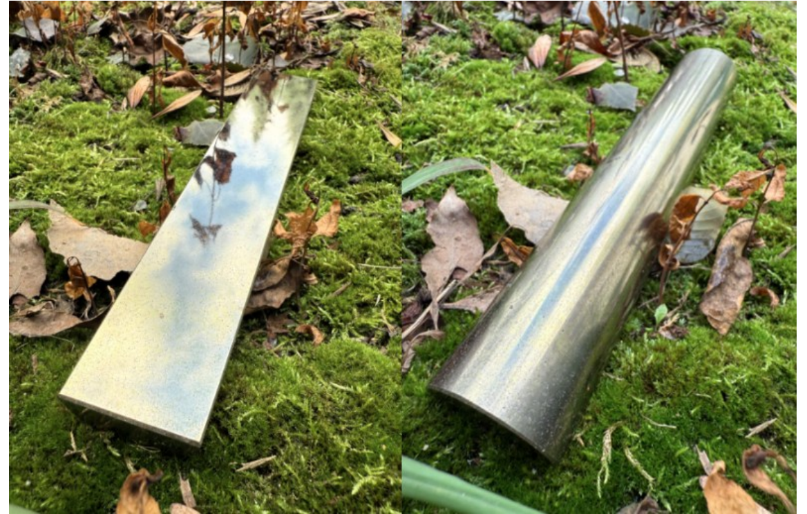
Polished core samples from Tamarack drill hole 25TK0563 heading to the Smithsonian National Museum of Natural History