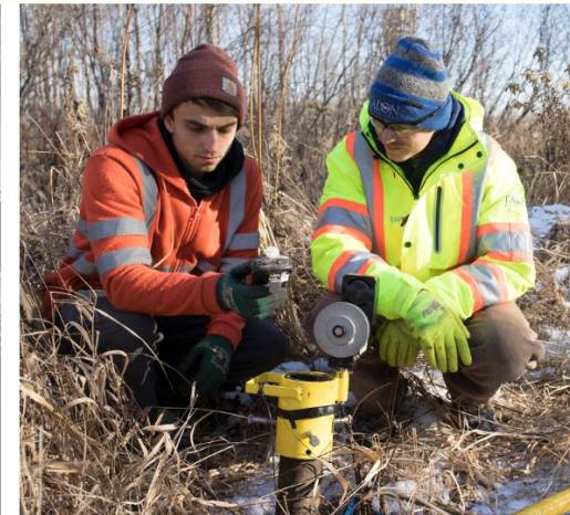
Eagle Mine, Tamarack Core shed and Tamarack Environmental Monitoring