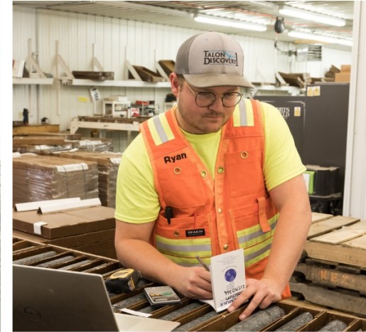
TALON METALS CORP