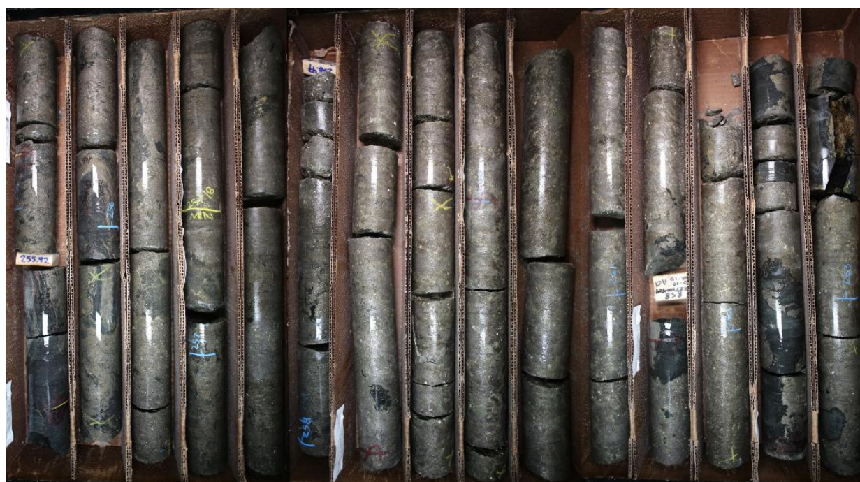
Figure 1: Drill core from drill hole 22TK0424 showing 10.49 meters of massive sulphide assaying 6.22% Ni located outside the Tamarack Nickel Project resource (near the CGO West area).

Tamarack, Minnesota (November 16, 2023) – Talon Metals Corp. (“ Talon ” or the “ Company ”) (TSX:TLO /OTC:TLOFF), the majority owner and operator of the Tamarack Nickel-Copper-Cobalt Project (“ Tamarack Nickel Project ”) in central Minnesota, today reports new holes drilled at the Tamarack Nickel Project, with numerous massive sulphide intercepts outside the Tamarack Nickel Project’s resource.