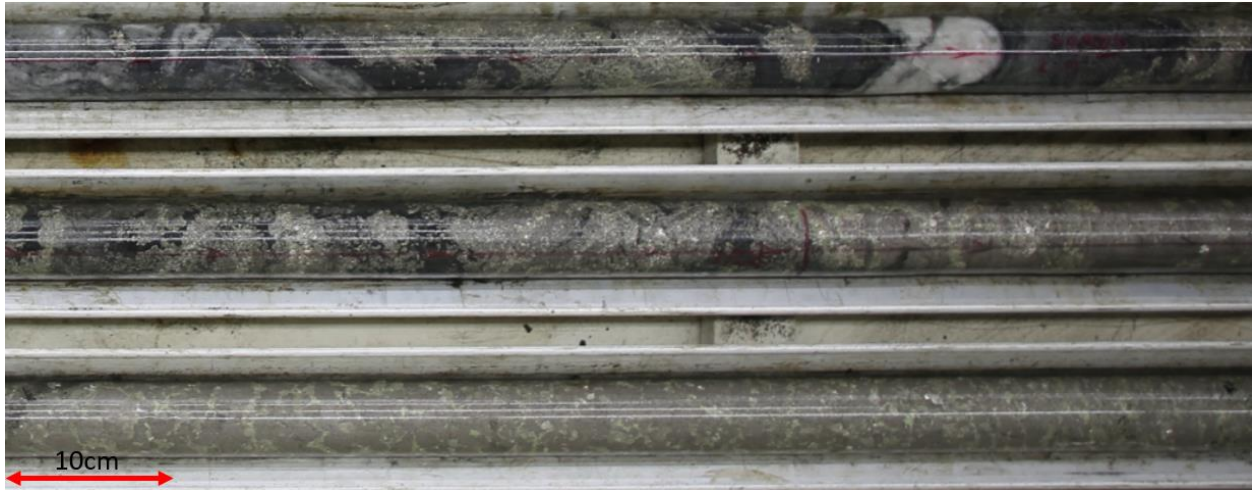
Figure 1: Photo cut-out of core to demonstrate style of sulphide mineralization intercepted in drill hole 16TK0233A (assays pending)