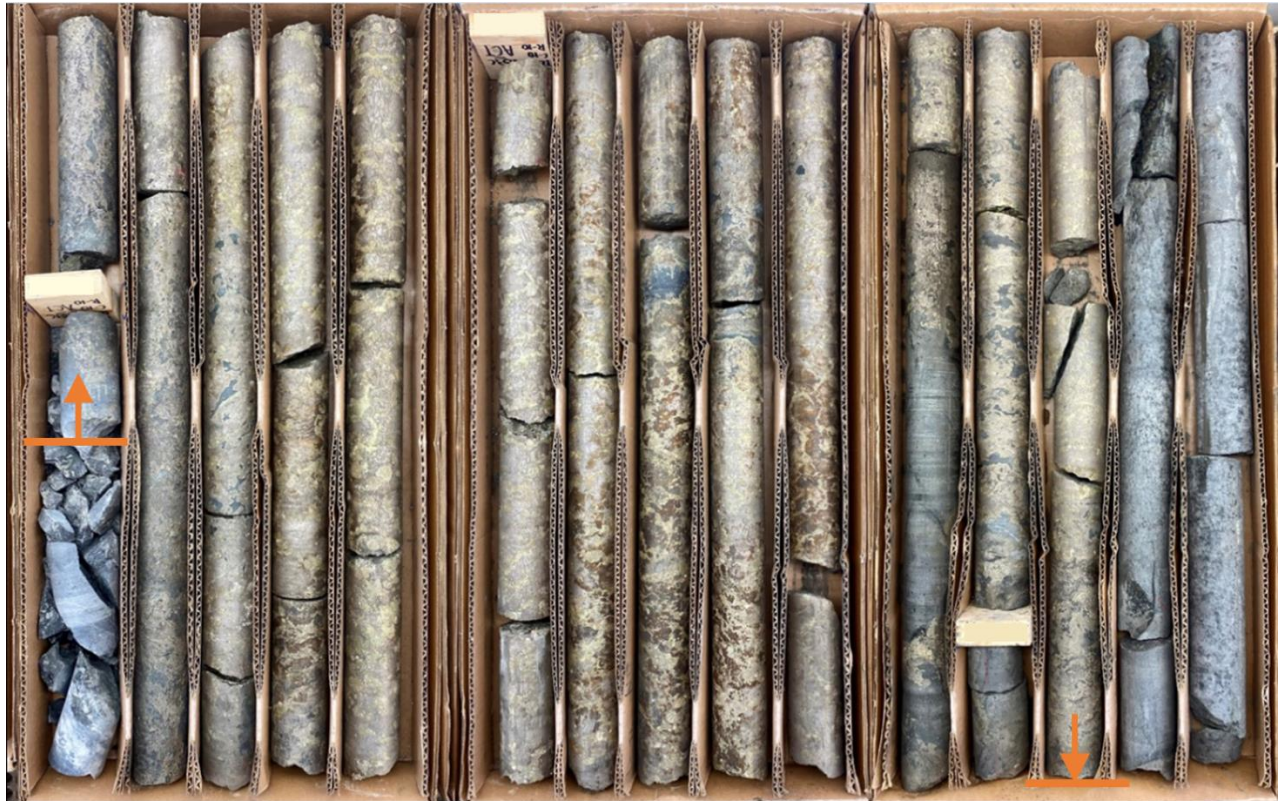
PHOTO OF MIXED AND MASSIVE SULPHIDES INTERCEPT IN DRILL HOLE 12TK153C, STARTING AT 578.45 METERS, GRADING 8.31% Ni, 3.26% Cu, 0.16% Co, 0.65 g/t Pd, 0.84 g/t Pt and 0.43 g/t Au (10.15% NiEq or 27.06% CuEq)