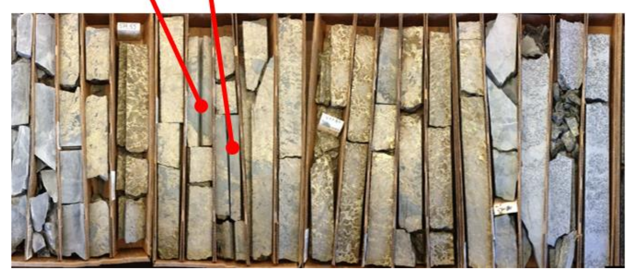
Figure 2: Image showing Metasediment and Mixed Massive Sulphide (MMS) units from drill hole 13TK0171, from 573.3m to 580.8 meters depth