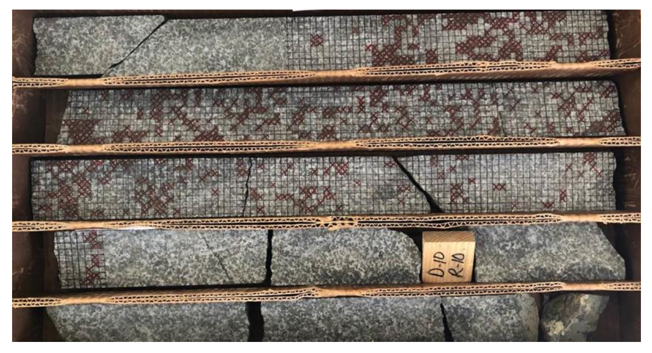
Figure 3: 1.5m sample interval, from 406m depth to 407.5m depth in drill hole 16TK0242, was broken down into a \frac{1}{4} " grid and marked where sulphide minerals were visually observed